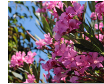
Oleander ( Nerium oleander )