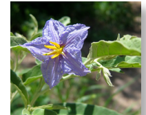
Silver Leaf Night Shade ( Solanum elaeagnifolium )