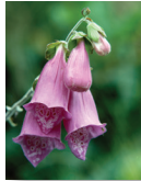
Foxglove ( Digitalis )