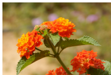
Lantana ( Lantana sp. )