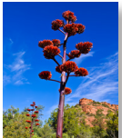
Century Plant ( Agave Americana )