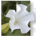
Jimson Weed ( Datura Stramonium )