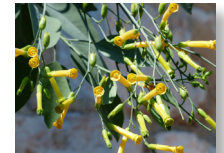
Tree Tobacco ( Nicotiana Glauca )