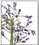
Chinaberry Tree ( Melia Azedarach )