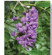
Texas Mountain Laurel ( Sophora secundiflora )