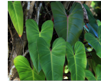
Philodendron ( Philodendron species )