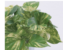
Pothos ( Epipremnum aureum )